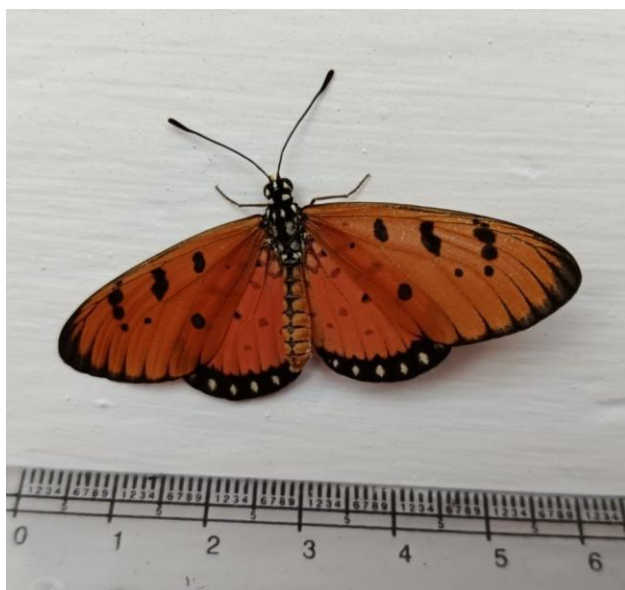
Figure 2. Acraea terpsicore , wing-span