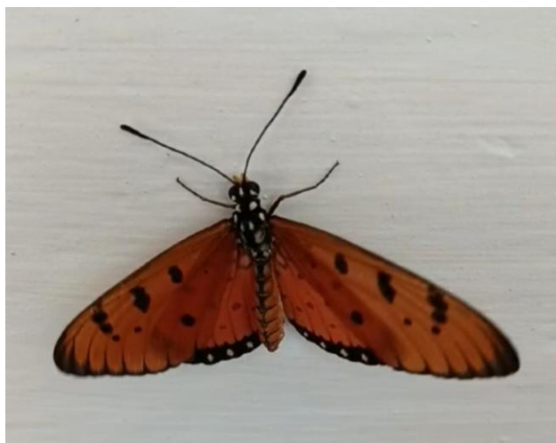
Figure 1. Acraea terpsicore , dorsal aspect